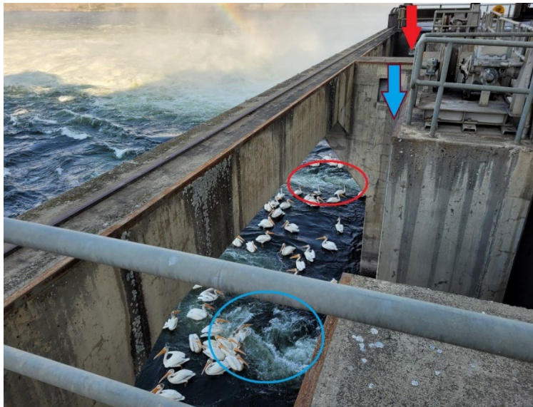
Figure 1: American white pelicans foraging at JDA SFL entrances NE-1 and NE-2. The blue arrow shows entrance NE-1, and the red arrow is entrance NE-2. The attraction flows are circled for reference (NE-1: blue, NE-2: red).

Future and Preventative Measures – Continue monitoring the areas for AWPE behavior and try to identify fish species taken.